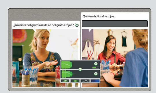
And finally, students get the fun of trying their new language in a real-life simulation. Speech recognition shows students exactly how they're doing.

Instruction. From beginning to end students build systematically toward their language-learning goals, for the most effective and enjoyable instruction anywhere.