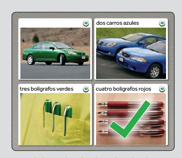
... and then check what they've learned.

Interactivity. In core lessons students constantly interact with the program to confirm their intuition.