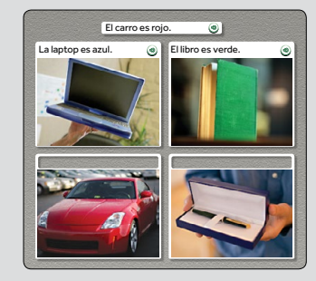
Now that they know colors, they can easily grasp the meaning of the new words ...

Intuition. Students advance using language they've learned and clues from new images. That's their intuition at work.