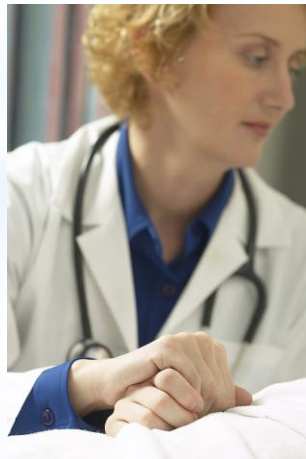
Certified Nurse Aide